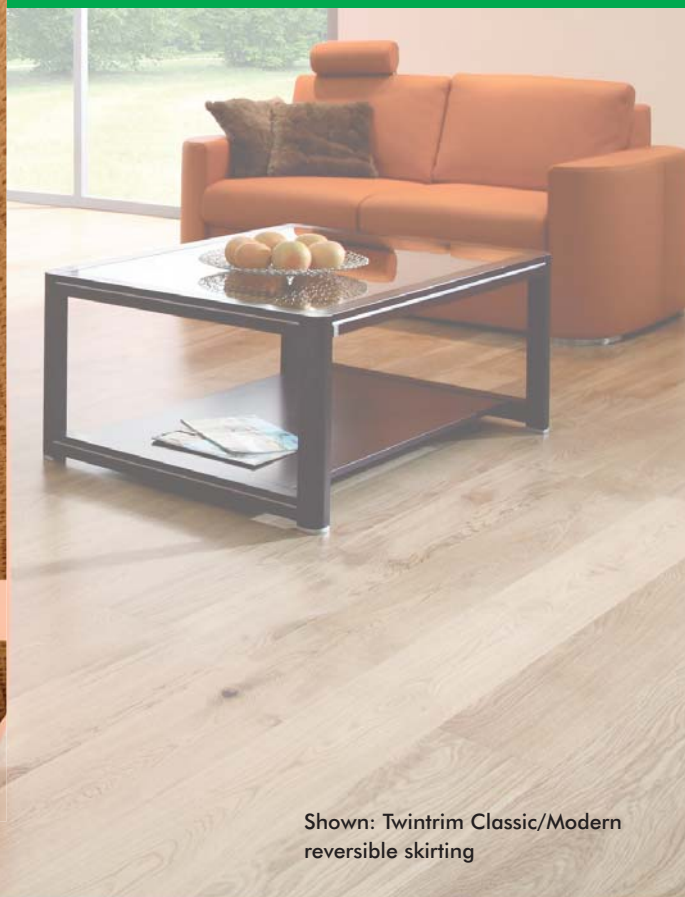
Shown: Twintrim Classic/Modern reversible skirting