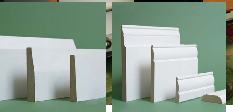
Inset images shown are bespoke primed MDF profiles which were manufactured to customer's own design specifications.

Based on years of experience, Howarth Timber & Building Supplies specialises in creating bespoke timber and sheet material solutions to exact specifications.