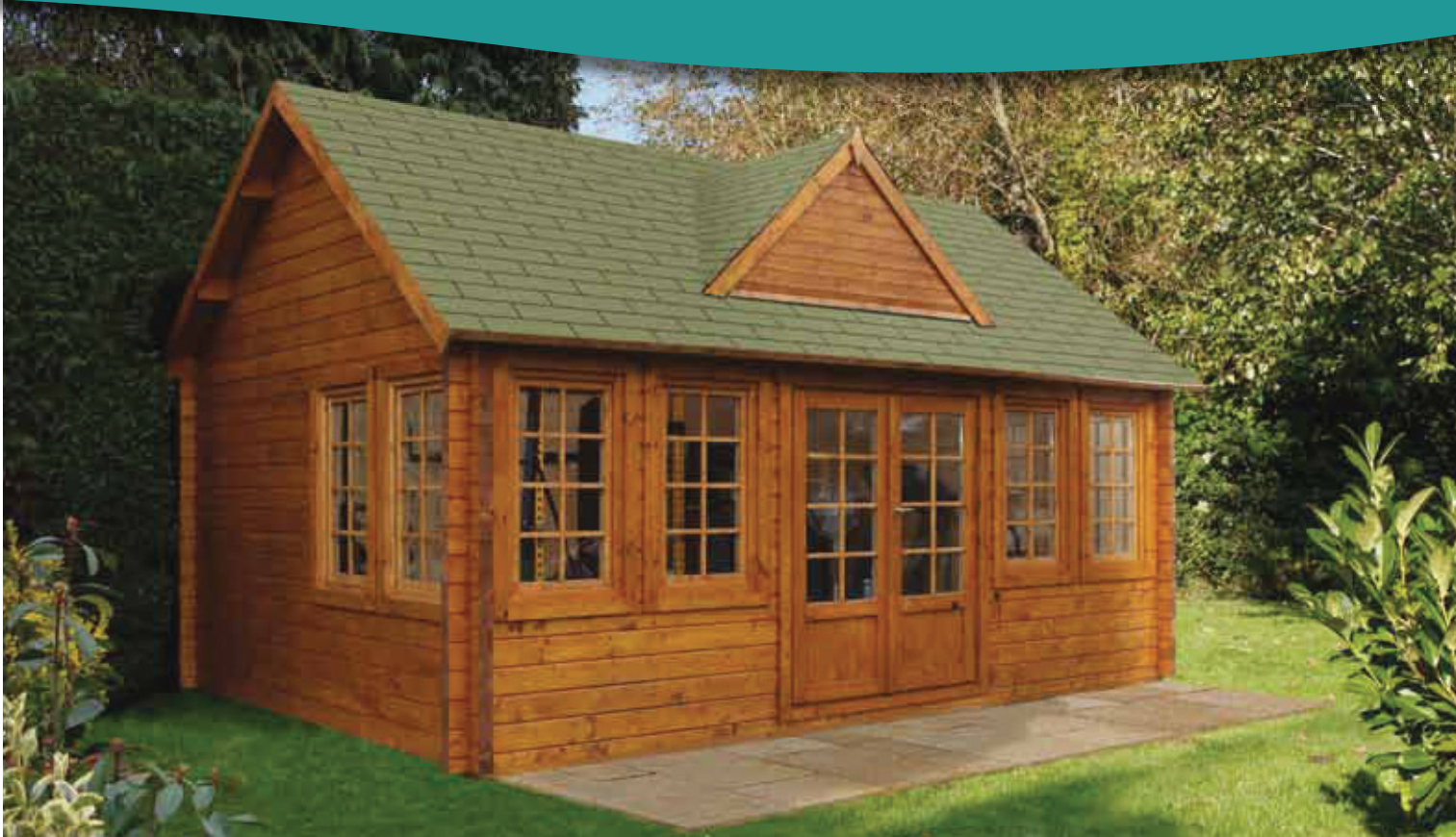
This model has been treated with a timber preservative. All log cabins come untreated and unpainted.