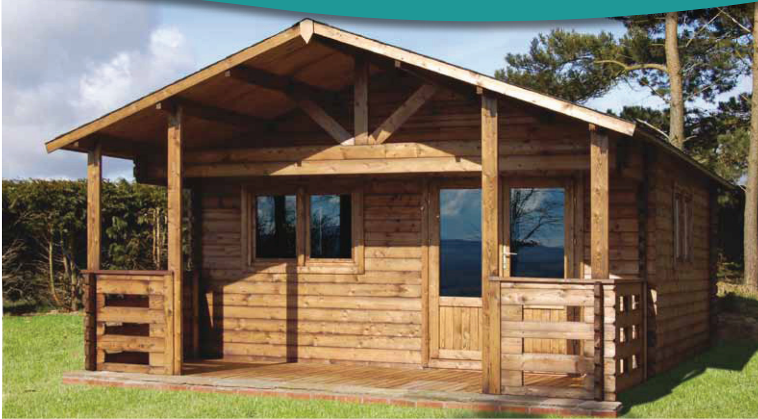
This model has been treated with a timber preservative. All log cabins are supplied untreated and unpainted

Manufactured from 44mm, smooth planed interlocking logs, it has three double glazed opening windows.