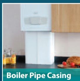
Boiler Pipe Casing